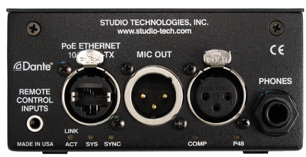
Figure 1. Model 205 Announcer's Console front and rear views